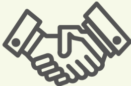
Business Community & Employers

The Equity Working Group has identified actions that should be taken by leaders across these sectors to improve equity in access and outcomes for Black students in Illinois.