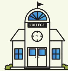
Colleges & Universities