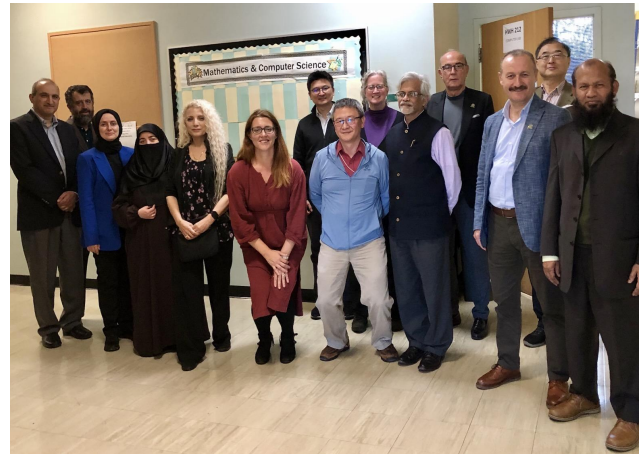
CIMST faculty met with a delegation of representatives from Kirikkale University and Islamic Science History Research Foundation, Türkiye, October 12, 2023.