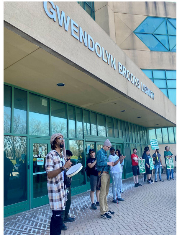
CSU faculty and friends rally outside the Gwendolyn Brooks Library (GBL) during a 10-day faculty strike ( UPLocal 4100 ), April, 2023.