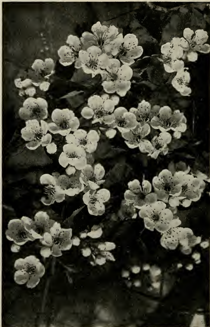
FIG. 19. HAWTHORN ( Crataegus sp.)