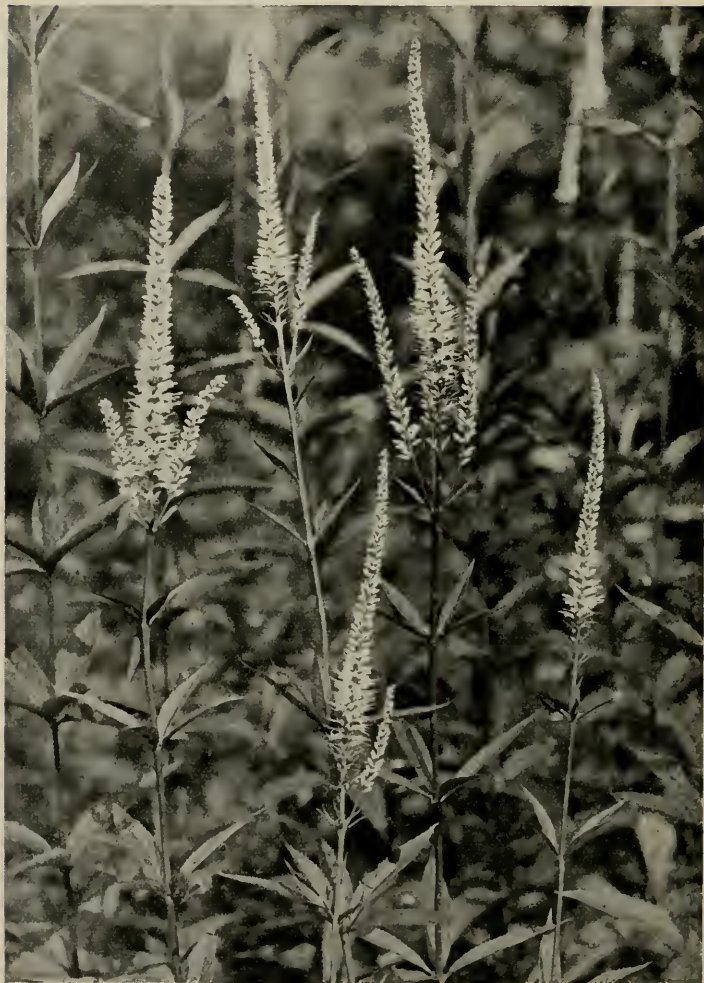
FIG. 31. CULVER'S ROOT ( Veronica virginica )