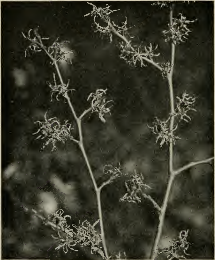
FIG. 18. FLOWERING BRANCH OF WITCH HAZEL ( Hamamelis virginiana )