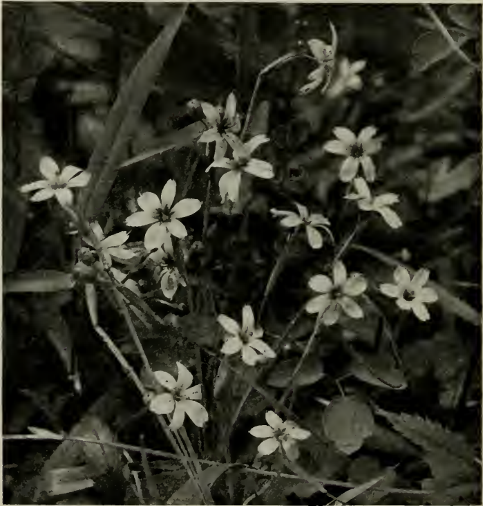
FIG. 9. BLUE-EYED GRASS ( Sisyrinchium angustifolium )

1. S. albidum Raf. Plant 1.5-4.5 dm. tall, pale green; stems twice as long as the flat leaves, 1-3 mm. wide; spathes with slender purplish