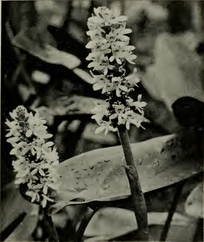
FIG. 2. PICKEREL-WEED ( Pontederia cordata )

1. P. cordata L. Stem stout, 3-12 dm. tall; leaves bluntly heart-shaped, spike dense, from a spathe-like bract; flowers violet-blue or white with a pair of yellow spots on the upper lip. ( Unisema Raf.) —Borders of ponds, in slow streams and lakes, very common, and