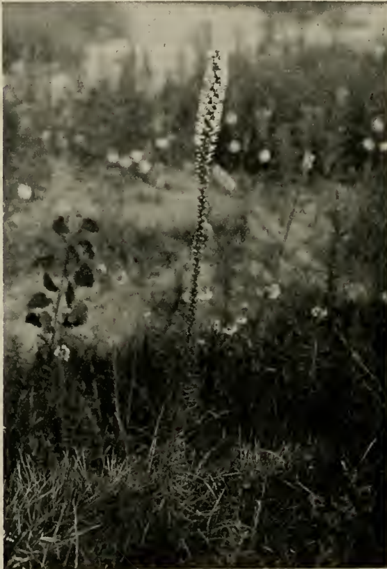
FIG. 37. BLAZING STAR ( Liatris spicata )

1. L. squarrosa Willd. 5-7 dm. tall; leaves long and rigid and very slender; heads few, 1.5-3.5 cm. long. ( Lacinaria Hill.)—Rare in dry soils from Pine to Dune Park. Summer.