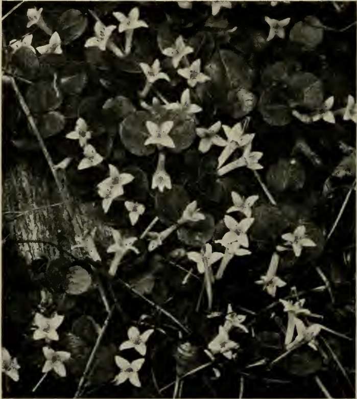
FIG. 33. PARTRIDGE BERRY ( Mitchella repens )

1. H. coerulea L. ( Innocence, Quaker-ladies. ) Leaves spatulate, very small; stems low, slender, sparingly branched; flowers sky blue