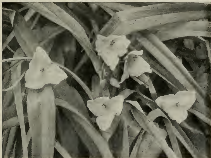
FIG. 4. SPIDERWORT ( Tradescantia virginiana )

Two of the cavities of the ovary 2-celled, one 1-celled; capsule 2-celled; each cell 2-seeded; flowers 4 mm. broad or more. . . . . C. communis 2.