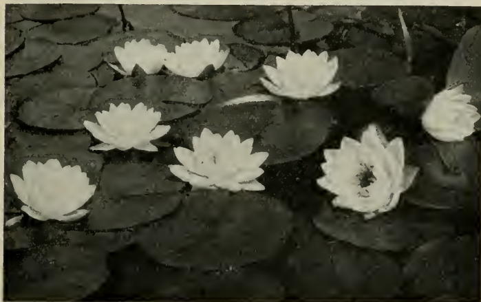
FIG. 13. WHITE WATER-LILY ( Nymphaea tuberosa )

Rootstocks creeping; leaves long-petioled, oval, floating, centrally attached beneath. Flowers axillary; sepals and petals 3 or 4, the latter linear; stamens 12-18, filaments threadform; pistils 4-18; stigmas linear; fruit a small club-shaped 1-2-seeded pod.