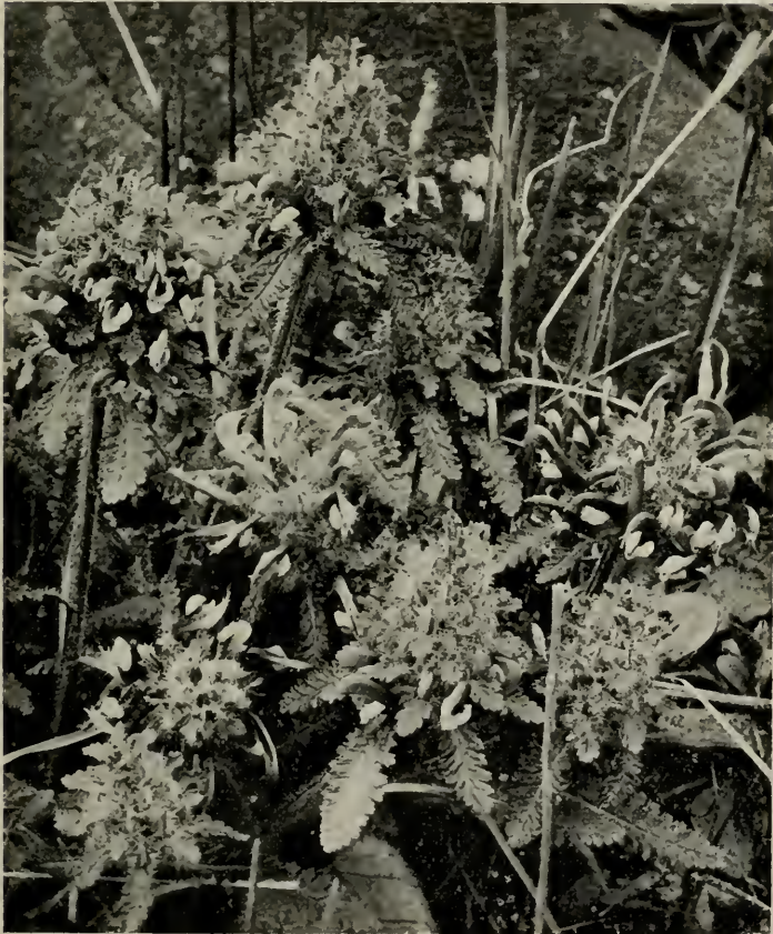
FIG. 32. WOOD BETONY ( Pedicularis canadensis )

1. P. canadensis L. ( Wood Betony .) Stems clustered, 1.5-4 dm. tall; lowest leaves pinnately parted; spikes short and dense; corolla