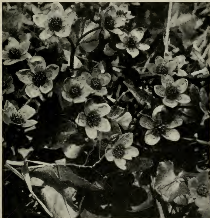
FIG. 14. COWSLIP ( Caltha palustris )

Perennials with 2-3-ternately compound leaves and lobed leaflets and showy solitary flowers terminating the branches; sepals 5, regular, petal-like; petals with a short spreading lip, much longer than the calyx; pistils 5, with slender tips; fruit of several erect many-seeded pods.