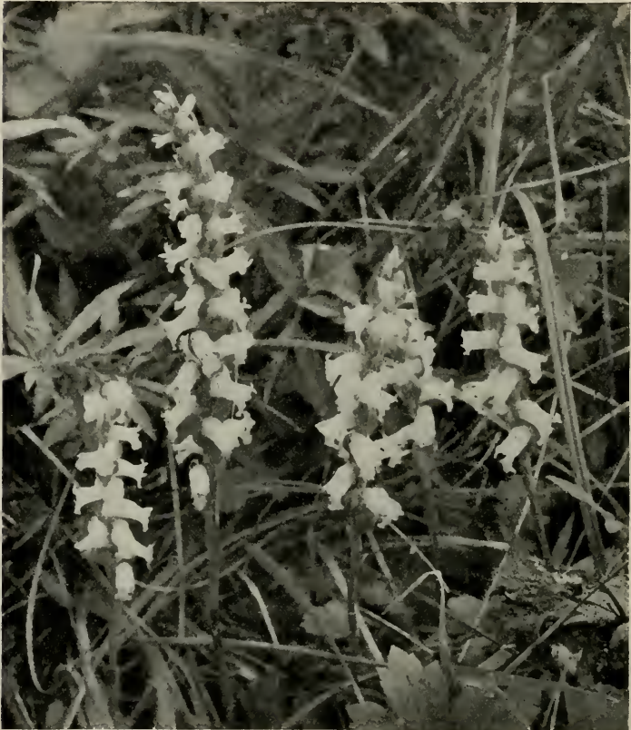
FIG. 12. LADIES' TRESSES ( Spiranthes cernua )

margin crisped; leaves mostly radical, often disappearing at flowering time. ( Ibidium House; Gyrostachys Kuntze; S. odorata Lindl.)—Common in meadows and on prairies throughout. September, October.