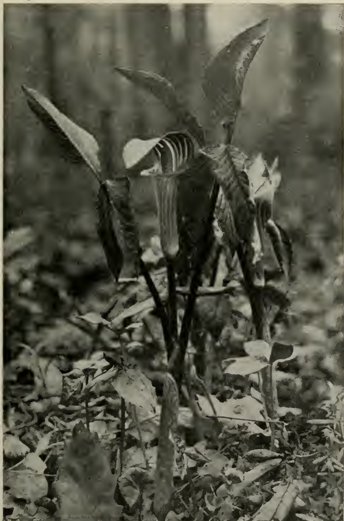
FIG. 3. JACK-IN-THE-PULPIT ( Arisaema triphyllum )