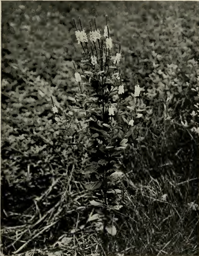
FIG. 27. HOARY VERVAIN ( Verbena stricta )

1. L. lanceolata Michx. Trailing, or with the tip erect; leaves oblanceolate to lanceolate, serrate above; peduncles slender, exceeding the leaves, bearing the solitary, closely bracted heads of bluish-white