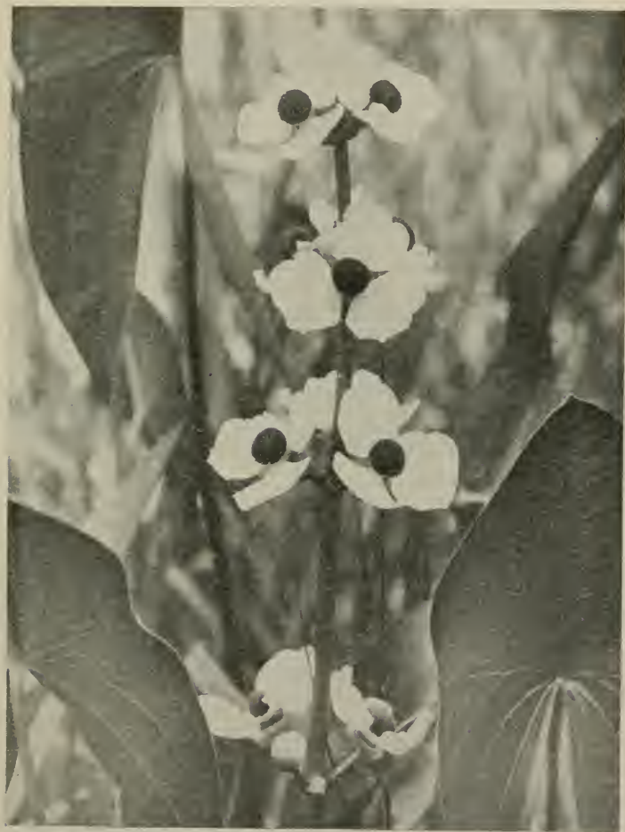
FIG. 1. ARROWHEAD ( Sagittaria latifolia )