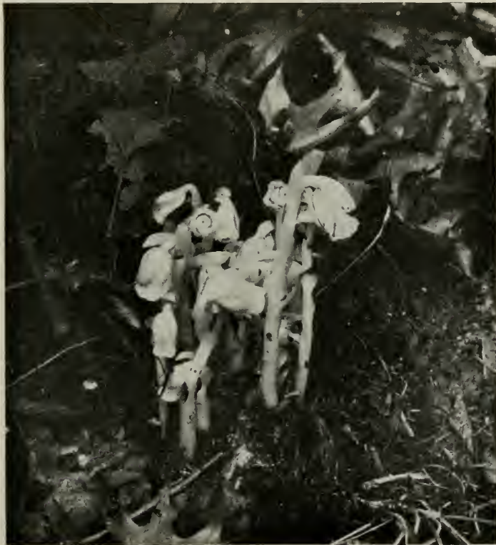
FIG. 23. INDIAN PIPE ( Monotropa uniflora )

Our species shrubs or creeping herbs with barely woody stems ( Gaultheria , Epigaea , Oxycoccus ), with chiefly alternate, often ever-green leaves and a 5-lobed calyx, and normally 5 united petals;