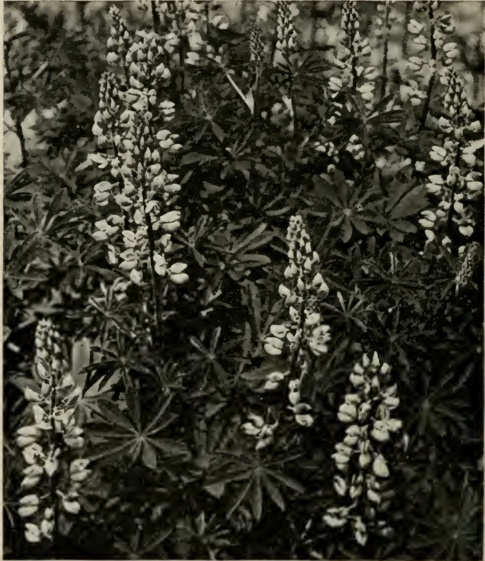
FIG. 21. LUPINE ( Lupinus perennis )

ellipsoid, long-stalked.—A showy species occurring in dry hollows and on old beach ridges in the Calumet District and in dune meadows. In flower during early summer it is one of the beauties of the region.