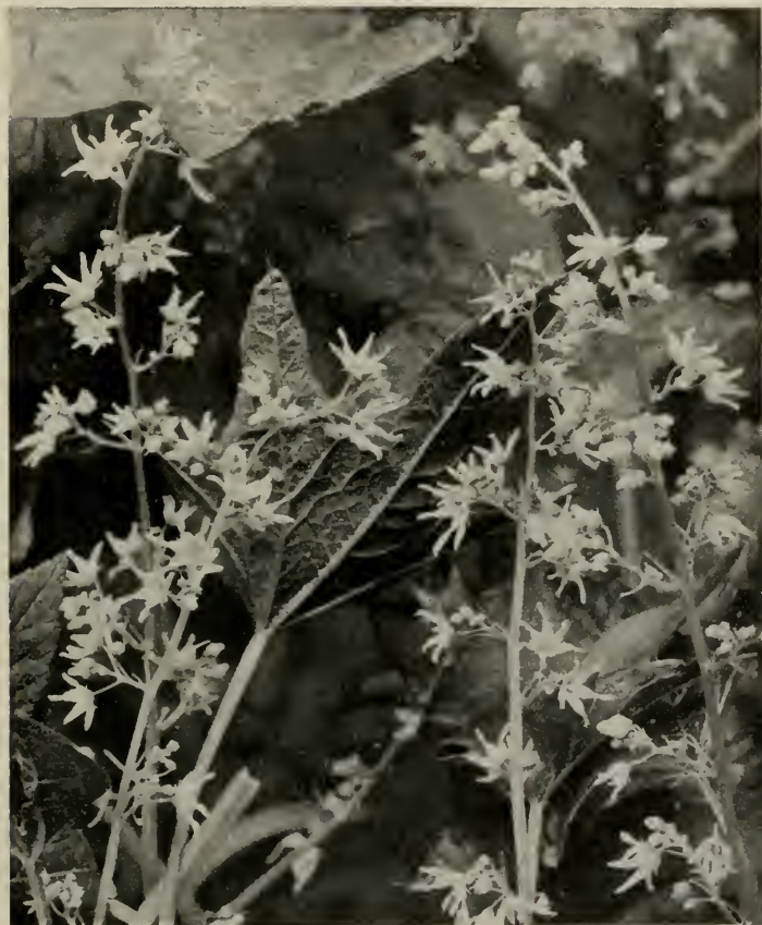
FIG. 36. WILD CUCUMBER ( Echinocystis lobata )

2-celled; stigma broad; fruit fleshy, becoming ultimately dryish, finally bursting at the summit and emitting the large flat hard seeds with roughened coats.