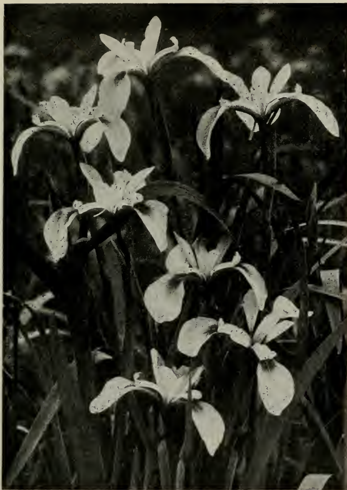
FIG. 8. BLUE FLAG ( Iris versicolor )