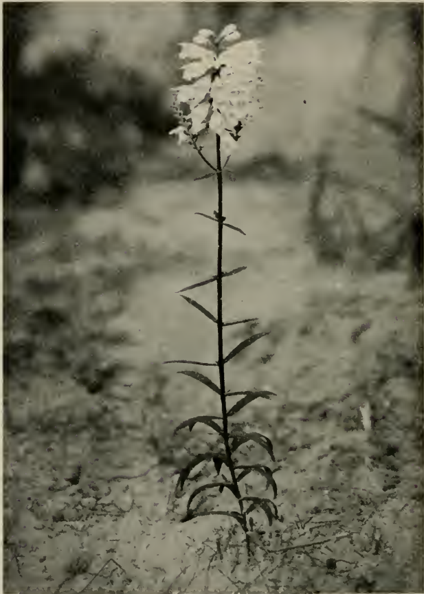
FIG. 28. DRAGON HEAD ( Dracocephalum virginianum )