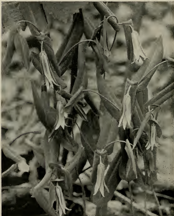
FIG. 5. BELL FLOWER ( Uvularia grandiflora )

latum Pursh.)—Common showy flower on the borders of sloughs and wet prairies, pine woods and swampy thickets in the Calumet District and east in the high dunes. June, July. True L. philadelphicum is reported by Pepon as rare in our area.