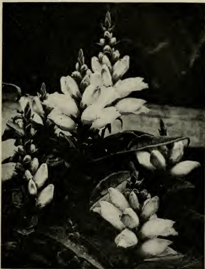
FIG. 30. TURTLEHEAD ( Chelone glabra )

Plants 1-4 dm. tall; corolla at least in part whitish; fruit on peduncles as long as or longer than the calyx..... G. virginiana 1.