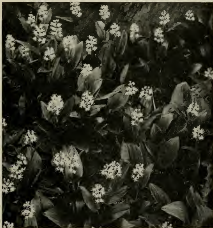
FIG. 7. WILD LILY-OF-THE-VALLEY ( Maianthemum canadense )

1. A. officinalis L., var. utilis L. ( Garden Asparagus .) Very tall, feathery plant with small greenish-white jug-shaped nodding flowers. —Escaped from cult. and abundant in the open sands of the dunes and close to the beach. The early spring shoots, thick and scaly, edible. Nat. from Eu. Summer.