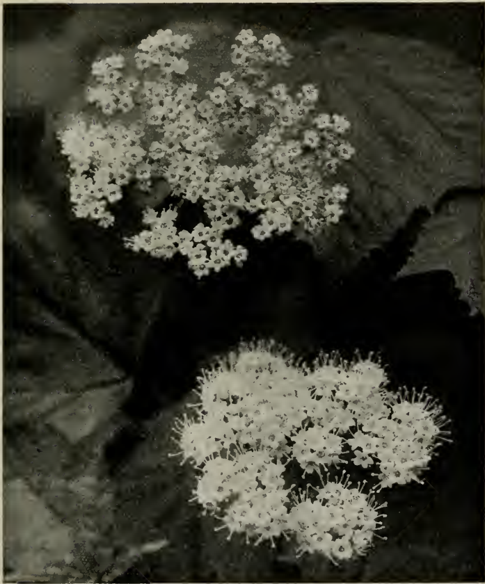
FIG. 35. HIGH-BUSH CRANBERRY ( Viburnum trilobum )

1. V. trilobum Marsh. ( High-bush Cranberry .) Shrub 1-4 m. tall, nearly smooth throughout; leaves broadly wedge-shaped or the base truncate, the pointed lobes spreading, toothed all around except in the entire sinuses; cyme broad; stamens elongate; fruit bright red, globose. ( V. edulum Raf., V. Oxycoccus Pursh, V. americanum of auths., not Mill. V. Opulus vars., of auths.)—In cool woods or thickets, infrequent from Pine eastward among the high dunes. The acid fruit is edible. The much-cultivated snow-ball bush is V. Opulus var. sterile DC. of the Old World.