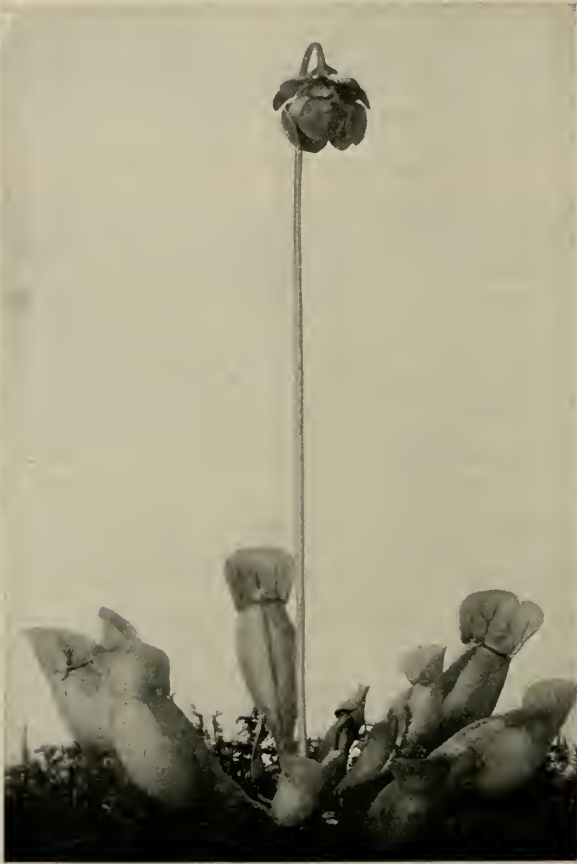
FIG. 17. PITCHER PLANT ( Sarracenia purpurea )