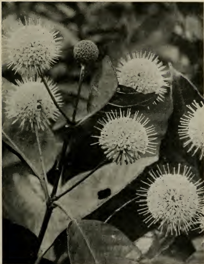
FIG. 34. BUTTONBUSH ( Cephalanthus occidentalis )