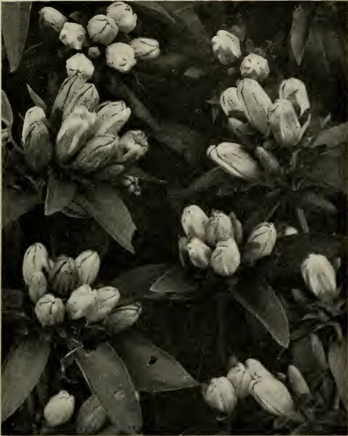
FIG. 26. SOAPWORT GENTIAN ( Gentiana Saponaria )