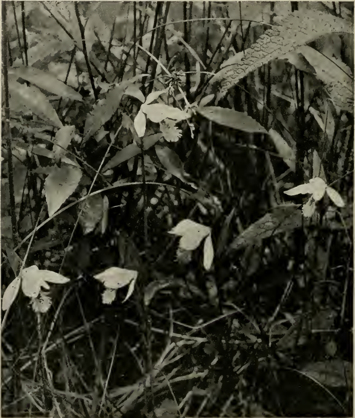
FIG. 11. SNAKE'S TONGUE ( Pogonia ophioglossoides )

1. P. ophioglossoides (L.) Ker. Plants 1-3 dm. tall, glabrous, bearing a single oval or lance-oval leaf near the middle and a bract