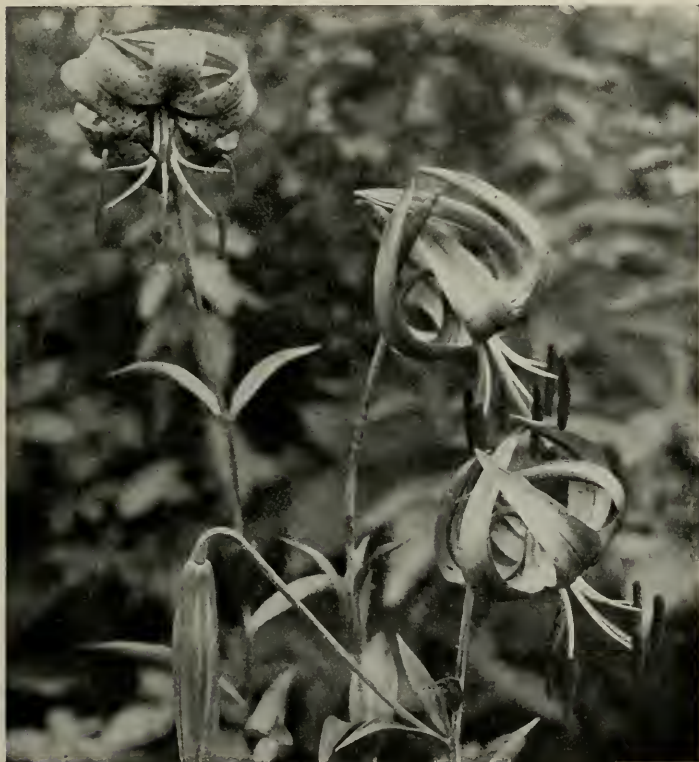
FIG. 6. TURK'S CAP LILY ( Lilium superbum )

7-8 cm. long, orange with dark purple or brown spots, strongly recurved; pods obovoid.—Abundant on the richer soil of the prairie region, and rarer eastward, as in rich soil along Dune Creek. Early summer.