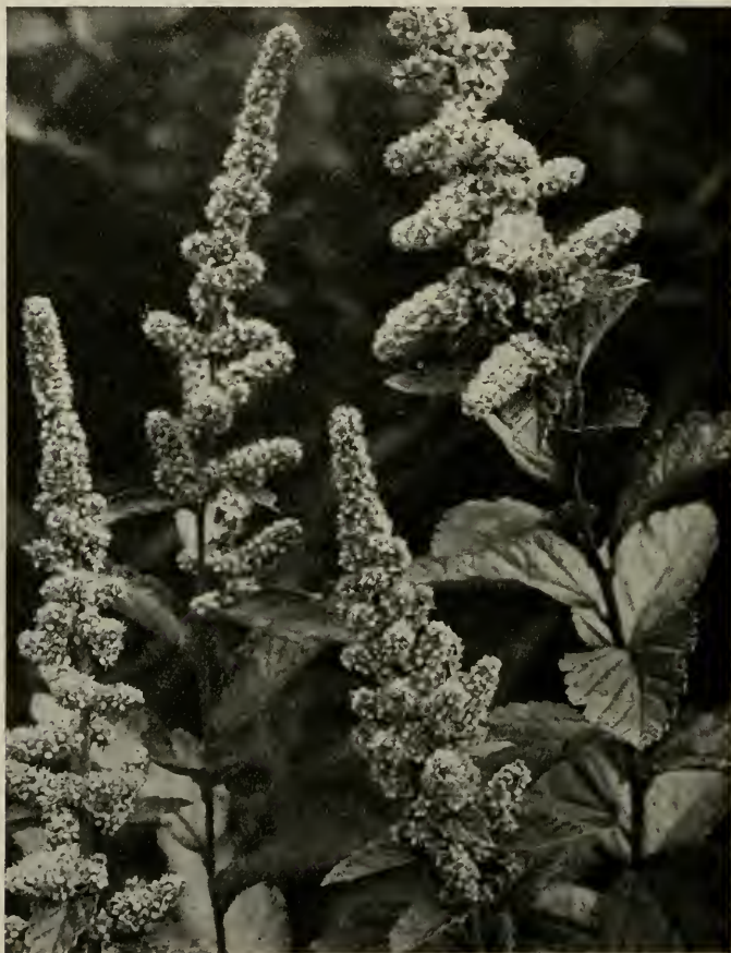
FIG. 20. HARDHACK ( Spiraea tomentosa )

1. Physocarpus opulifolius (L.) Maxim. Much branched; old bark exfoliating in long thin strips; leaves ovate to nearly round, more or less 3-nerved, irregularly double-crenate, nearly smooth above, pubescent beneath; flowers white, about 25 in a corymb; calyx half as long