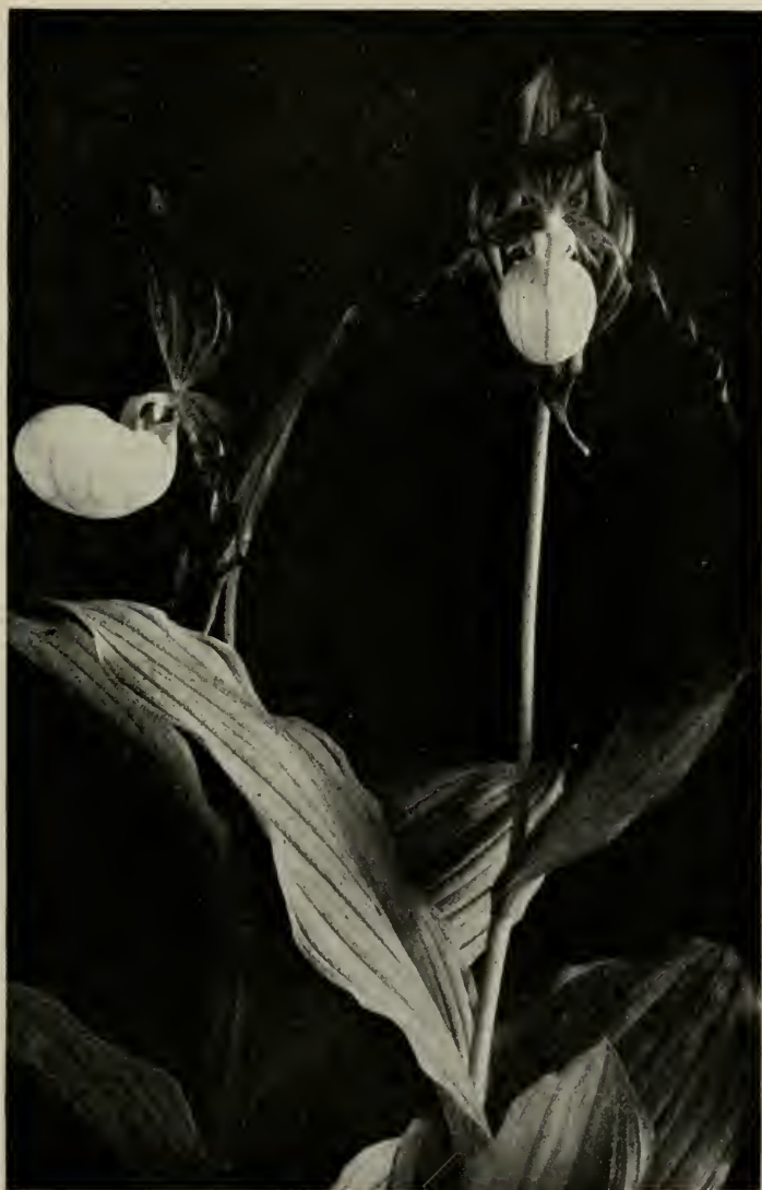
FIG. 10. YELLOW LADY'S-SLIPPER ( Cypripedium parviflorum )