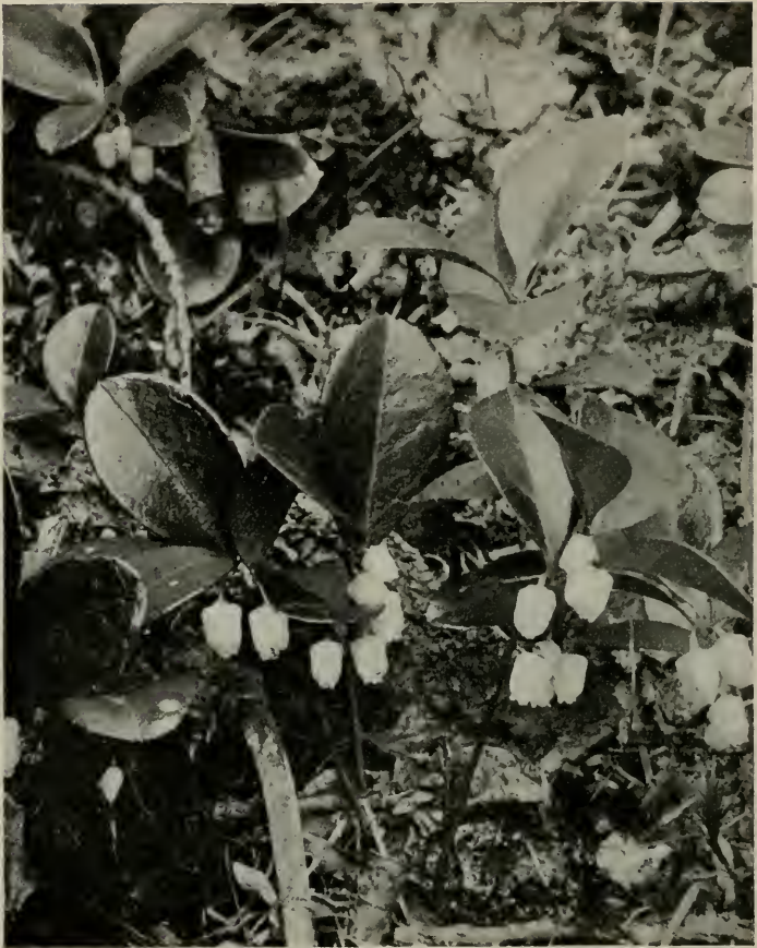
FIG. 25. CHECKERBERRY ( Gaultheria procumbens )