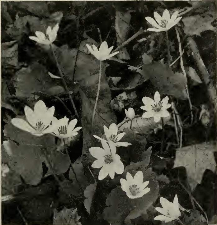
FIG. 15. BLOODROOT ( Sanguinaria canadensis )

leaflets; flower solitary or a few in an umbel; petals deep yellow, broad; stigmas 3 or 4; pods ovoid.—A beautiful spring flower, rare, chiefly on limestone and prairies, occasional as far north as Pine and Miller. A few plants found at Mineral Springs.