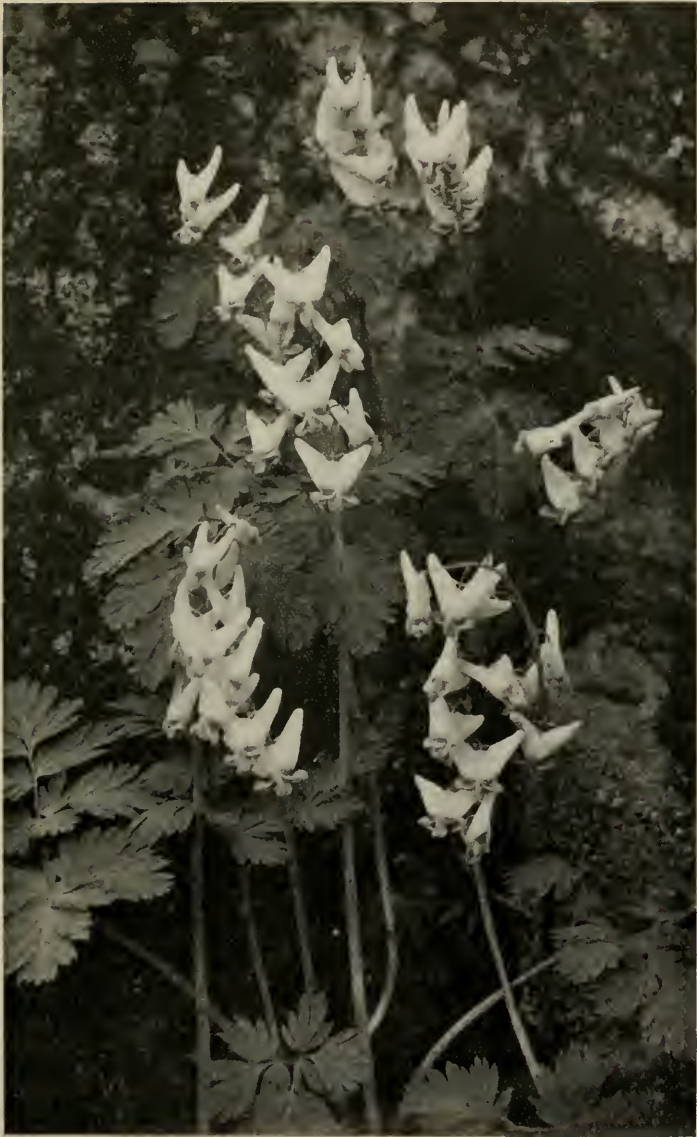
FIG. 16. SQUIRREL CORN ( Dicentra canadensis )