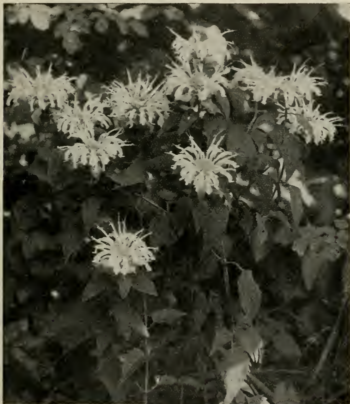
FIG. 29. WILD BERGAMOT ( Monarda fistulosa )

throat, 10-13-nerved; corolla with inflated throat and straight tube, distinctly 2-lipped, the upper lip flattish and erect, the lower 3-parted with larger middle lobe. ( Satureia .)