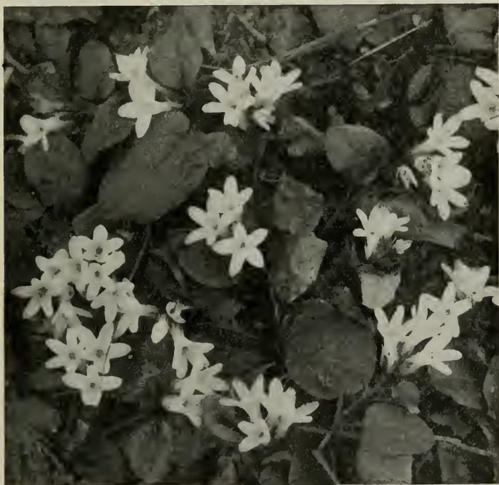
FIG. 24. TRAILING ARBUTUS ( Epigaea repens )

Shrubby or subherbaceous creeping plants with ascending branches and evergreen alternate leaves, and axillary flowers, the pedicels 2-bractletted; corolla cylindrical-ovoid or urn-shaped, 5-toothed; capsule depressed, 5-lobed, many-seeded, forming a berry-like, globular, red fruit.