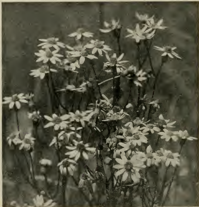
FIG. 38. GROUNDSEL ( Senecio aureus )

2. S. Balsamitae Muhl. Stems 1.5-3 dm. tall, more or less woolly at base, smooth above; lower leaves mostly oblong-lanceolate, gradually narrowed to a slender petiole, sharply toothed or crenate; upper leaves lyrate, pinnatifid, or entire and small.—Prairies and thickets of the Calumet District. Summer.