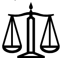
Table 131

Our seventh risk factor pertains to injury and violence. Nationwide, 10.6 deaths per 100,000 population were attributable to firearms in 1999. The comparable number for Indiana was 11.3 deaths per 100,000 population. Again, however, there are significant disparities based on race and ethnicity. In Indiana, 38.0 African-American deaths were recorded per 100,000 population in 1999. Only the District Columbia reported a higher death rate due to firearms among African-Americans.