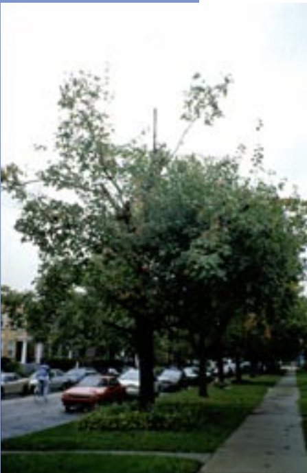
A street in the Ravenswood neighborhood before tree removal and after

The city was incredibly fast and efficient and was remarkable in the removal. I am still amazed by how specifically they worked and how swiftly it was done. I woke up to the sound of chain saws, grabbed my camera, and ran outside to witness it. It was a dreary day marked with the thundering crashes of trees hitting pavement, the crackling of