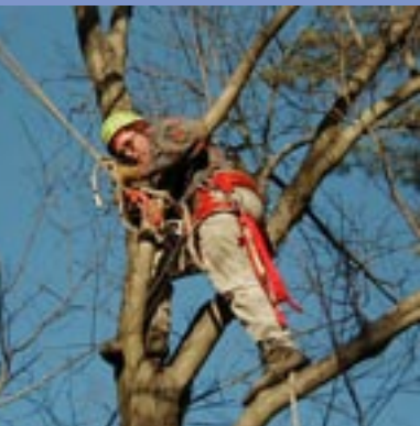
A USDA Forest Service tree climber checks trees for ALB in a Chicago neighborhood

Sometimes they're scary to watch when they're up in those trees, but they do the job for us." Between the bucket trucks and the tree climbers, the surveyors were able to double the number of infested trees identified before the beetles began to emerge again in the late spring of 1999. Crews of USDA Forest Service and contract climbers now work throughout the year doing inspections in both Chicago and New York.