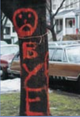
Ravenswood residents found a variety of ways to express their sorrow over the loss