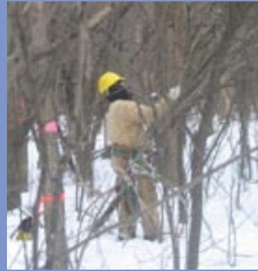
Surveys continued year round, even in the cold and snow

The day the trees came down was still an awful day. It was horribly damp and cold and drizzly. The city was so incredibly efficient at getting all the cars to park somewhere else and worked methodically to remove all the infested street trees. The Street and Sanitation crews were out in full force and were incredibly efficient. It seemed like in no time at all the trees were gone. There were clusters of people everywhere watching—under porches, from windows, under umbrellas. There