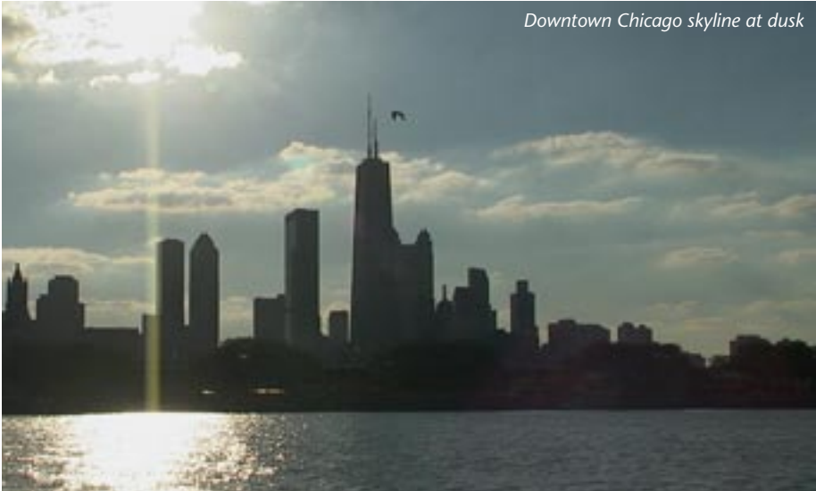
Downtown Chicago skyline at dusk