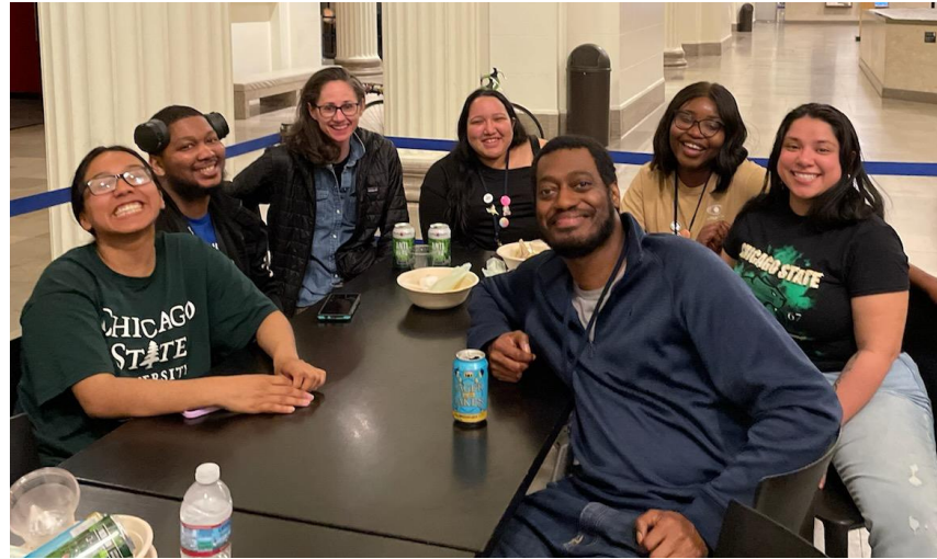
Field Museum Members Night