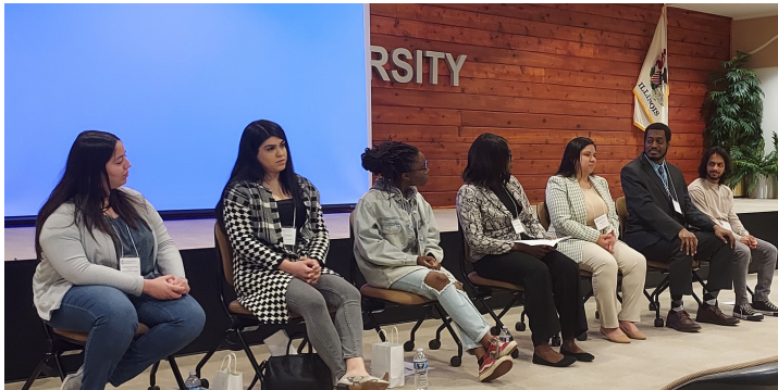
Chicago Symposium Series