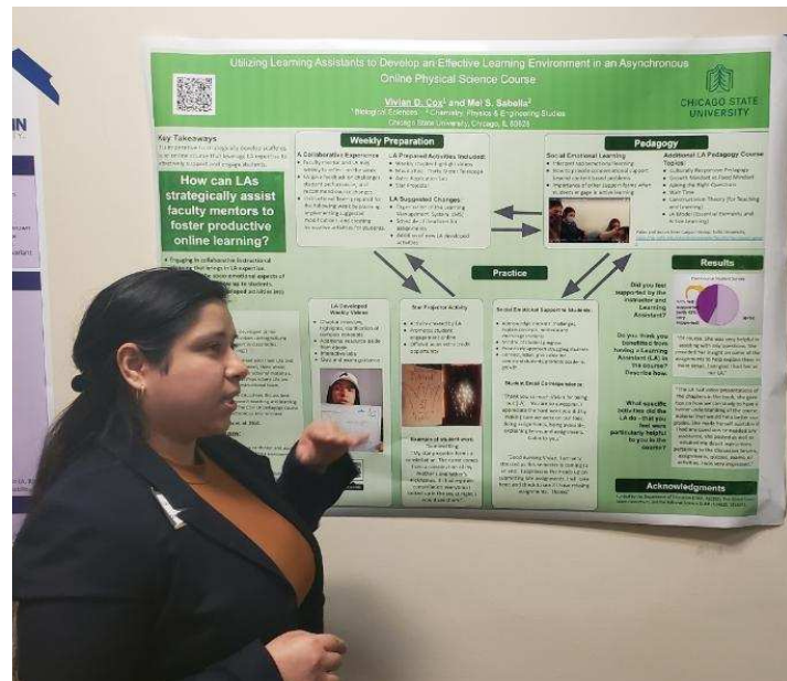
Tri-Beta Poster Presentation