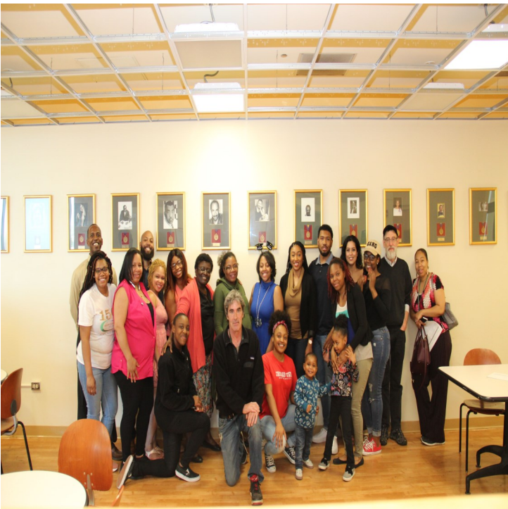
Graduating Senior Appreciation Dinner 2018