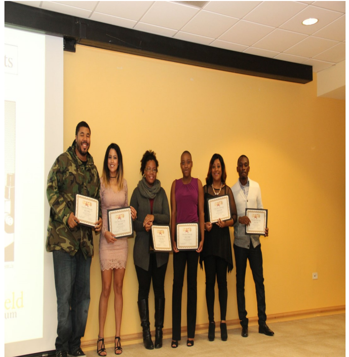
Scheinbuchs Recipients 2017